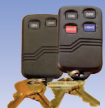
5804-2/5804 Two/Four-Button Wireless Keys